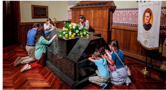
People can invoke the intercession of Blessed McGivney at his tomb in St. Mary Church in New Haven, part of Blessed Michael McGivney Parish. His remains are placed in a sealed, double bronze coffin within a polished granite sarcophagus at the rear of the church.