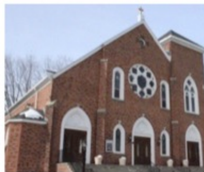
St. Augustine Church 35 Washington Ave

Vigil Mass Saturday 4:30 pm Sunday Mass 11:00 am Weekdays (M,T,W,Th,) 9:00 am Sat. Confession 3:30 - 4:00 pm