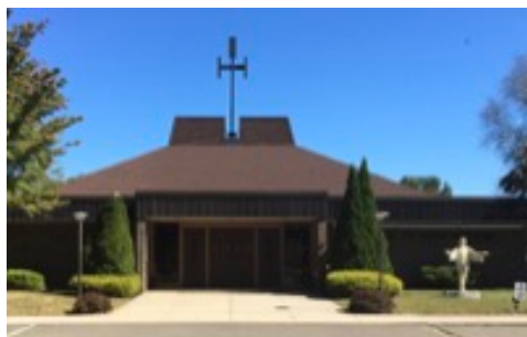
Church of the Good Shepherd 135 Mountain Road