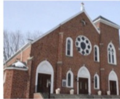
St. Augustine Church 35 Washington Ave

Vigil Mass Saturday 4:30 pm Sunday Mass 11:00 am Weekdays (M,T,W,Th,) 9:00 am Sat. Confession 3:30 - 4:00 pm