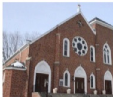
St. Augustine Church 35 Washington Ave

Vigil Mass Saturday 4:30 pm Sunday Mass 11:00 am Weekdays (M,T,W,Th,) 9:00 am Sat. Confession 3:30 - 4:00 pm