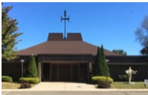
Church of the Good Shepherd 135 Mountain Road