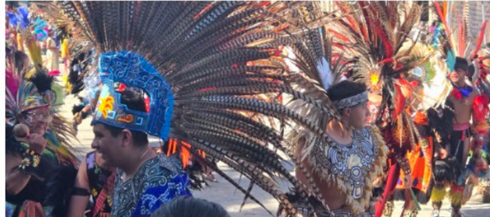
Hundreds of people are dancing to drums in traditional native dress in the plaza in front of the Basilica of Our Lady of Guadalupe in Mexico City.

The experience inspired him to create a more intentional and joyful celebration of the Feast of Our Lady of Guadalupe at Sacred Heart this year on Dec. 12. Before leaving for Mexico, he asked parishioners if they had prayer intentions he could bring to the Basilica.