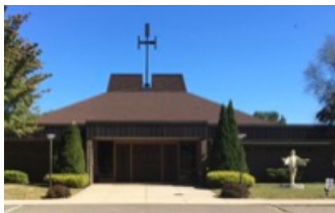
Church of the Good Shepherd 135 Mountain Road