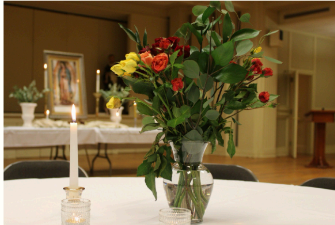
Roses, candles and religious images set a quiet and prayerful tone for a SEEN gathering.

"The name 'SEEN' is important because very often, nobody knows what happened. The parents hold it inside," she explains. "But we're here to affirm the dignity of the life lost. As Catholics, we believe that life begins at conception, and every soul has meaning and purpose."