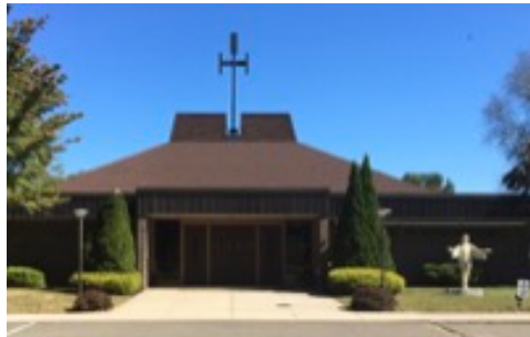
Church of the Good Shepherd 135 Mountain Road