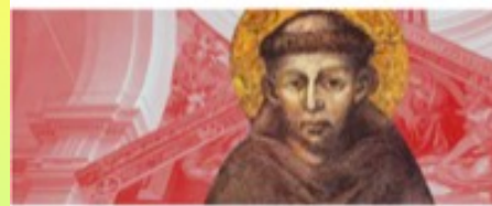
POPE LEO XIV PROCLAIMS FRANCISCAN JUBILEE YEAR