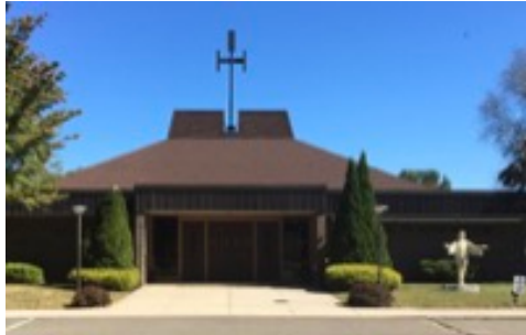
Church of the Good Shepherd 135 Mountain Road